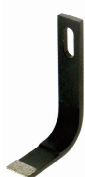
20/0109-D Model 286 gripper