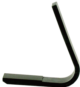
20/0100- starting at $40.00