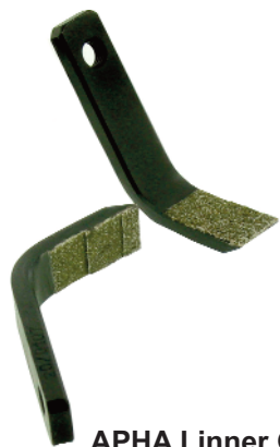
APHA Linner Gripper 20/0107 #7500.1522.4

Recondition Muller Martini gripper fingers with a Urethane or a Diamond gripping surface. The urethane is casted onto the gripper fingers and cured to a 90 to 92 shore hardness. The Diamonds are electrolytically bonded and come in sizes of 60/80, 100/120, 180 grit. Our normal time for reconditioning your grippers will be seven working days or sooner.