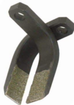
20/0108 Insert gripper