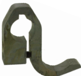
20/0102- Recondition your's