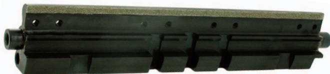
2R/3064-Gear Side C8.458.715F

Each Cylinder Gear side each bar Clamp. 2 X $325.00 = $650.00 Price per set. Middle side each bar Clamp. 2 X $325.00 = $650.00 Price per set Operator side each bar Clamp. 2 X $325.00 = $650.00 Price per set (6 Bars) The total price for two Cylinder is $1,950.00