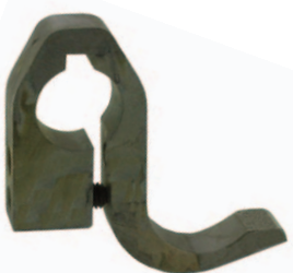
20/0102- Recondition your's