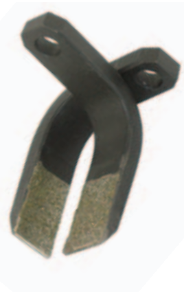
20/0108 Insert gripper