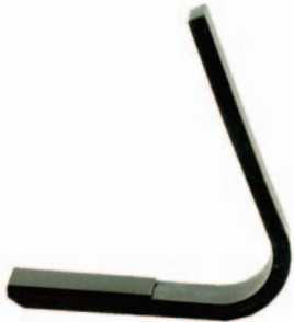
20/0100- starting at $40.00