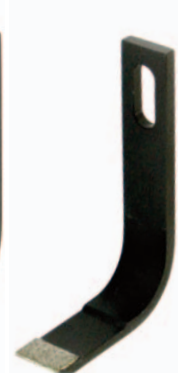
20/0109-D Model 286 gripper