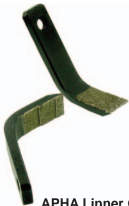
APHA Linner Gripper 20/0107 #7500.1522.4

Recondition Muller Martini gripper fingers with a Urethane or a Diamond gripping surface. The urethane is casted onto the gripper fingers and cured to a 90 to 92 shore hardness. The Diamonds are electrolytically bonded and come in sizes of 60/80, 100/120, 180 grit. Our normal time to recondition your gripper will be five working days or sooner.